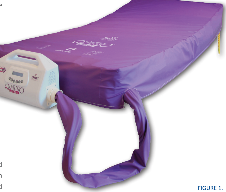
FIGURE 1. QUATTRO® PLUS active mattress replacement system

Submissions were scored and ranked by procurement. Clinical product evaluations were assessed by tissue viability, medical equipment library and the Chief Nurse.